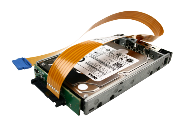
Drive Module - Attached to a drive carrier

QTL1215 6G SAS LITE Drive Module QTL1301 6G SAS HS LITE Drive Module QTL1177 6G SAS HS Drive Module QTL1490 6G Keyed SATA HS Drive Module