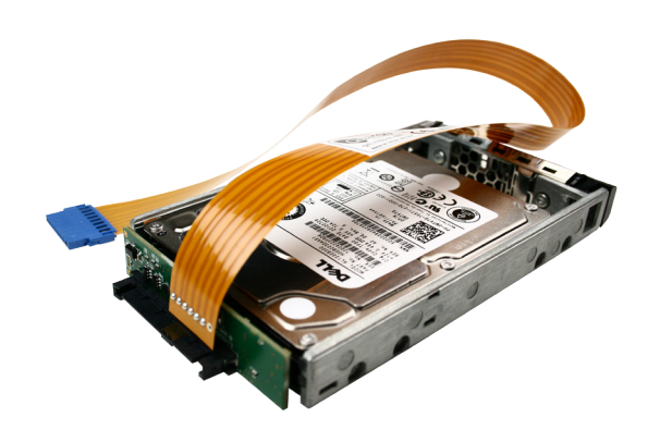
Drive Module - Attached to a drive carrier