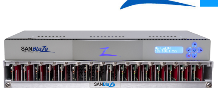
SANBlaze SBExpress-RM4 Dual Port NVMe Drive Test System